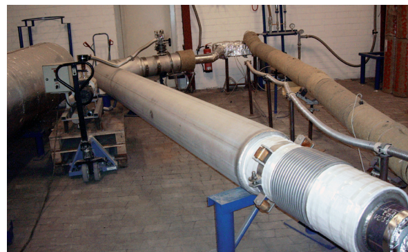
Figure 3: FW-Kammer-Pipe during assembly